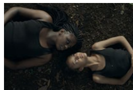
Land of Ashes