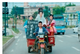
To Live to Sing