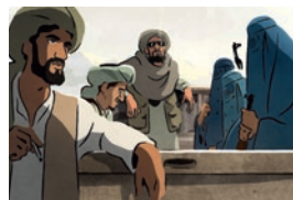
The Swallows of Kabul