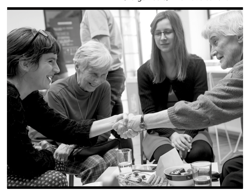
Explore Impact: How to reach new audiences and boost impact

In this part, we will introduce the strategies that we (and many other festivals) use to enhance the impact of the films and reach as many viewers as possible. We are acutely aware that doing impact festival work is a long-distance run. You can never do it perfectly and give space to all the ideas and causes that deserve attention. You can also probably never figure out and make use of all the impact instruments and channels that exist. That is why we are especially grateful to fellow festival organisers, who have contrib-