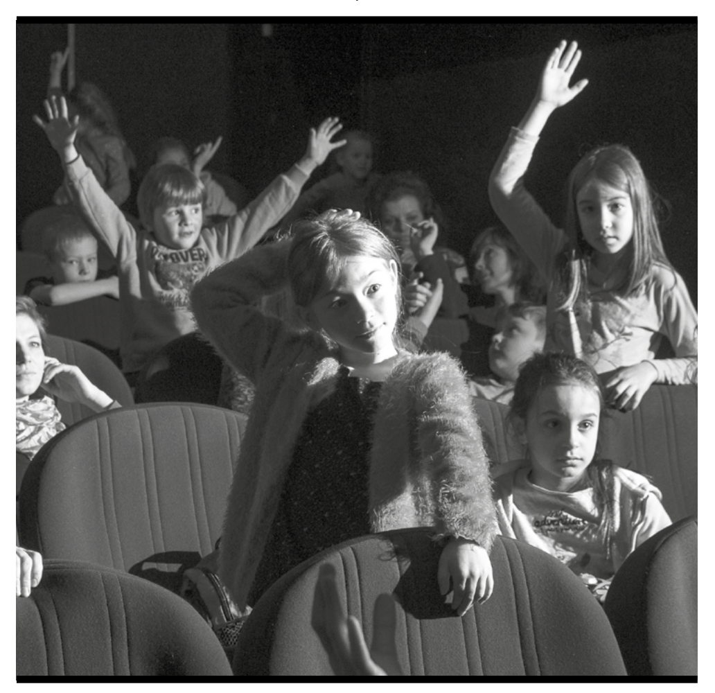
Explore Impact: How to reach new audiences and boost impact

The aim of the research was to evaluate the impact of the festival on its audience, and what forms this impact takes. The overall concept of the assessment is based on an empirical qualitative survey whose