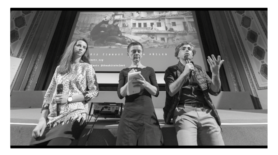
Explore Impact: How to reach new audiences and boost impact

not to cover the whole field, but to show several ways you can work with impact, without even having to call it "impact". Another aim was to demonstrate that documentary festivals are functioning platforms for deepening the impact of films, and that they have many instruments for it at their disposal. As such, they can be useful partners for filmmakers who plan to do more than just screen a film. We would like to thank everyone who contributed with their experience and great tips, especially our colleagues from Ambulante, CinéDOC-Tbilisi, Docudays UA, Human Rights Watch Film Festival, Movies That Matter, Sheffield Doc/Fest, Take One Action and True/False.