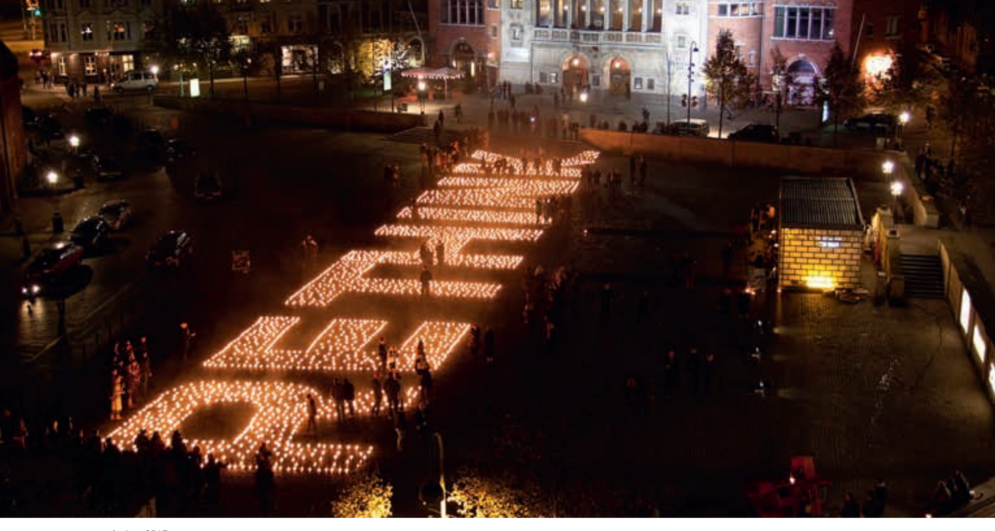
Aarhus 2017 — Rethink landscape

summer carnivals. 'Neighbourhood weeks' constituted themselves as an association and have continued to arrange the weeks every year. An accessibility project has been managed by the Arts Academy at Turku University of Applied Sciences, and now accessibility activities and education are strongly embedded in its syllabus.