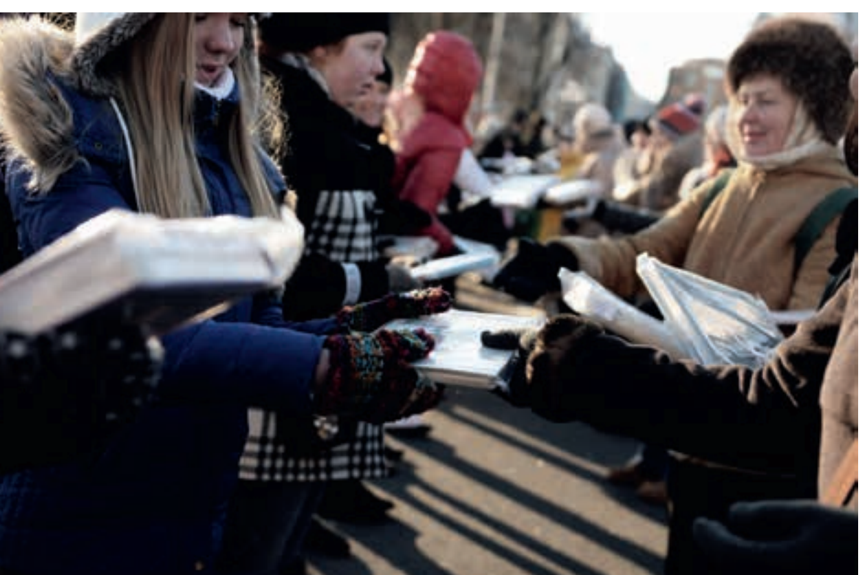
Umeå 2014 — Closing ceremony, Northern light

Riga 2014 — Chain of book lovers