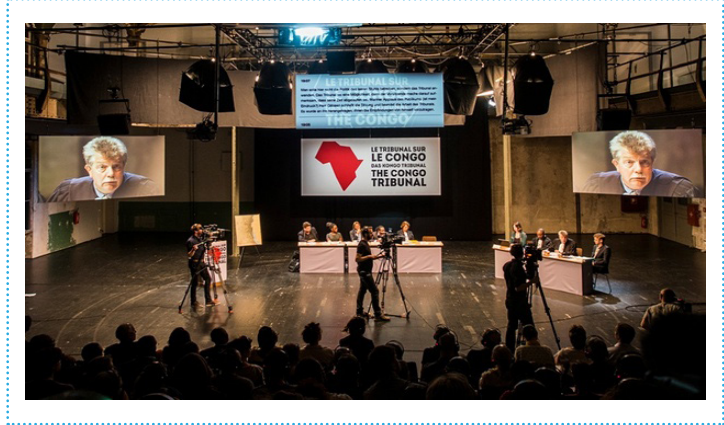
Milo Rau, 'The Congo Tribunal'

Art is always a symbolic act; you can't resolve the problems, but what I think we can do is to show what might be possible. Because people think it is impossible; in terms of the Congo they think '6 million dead people, a totally corrupt regime, international enterprises acting totally outside the law, and so on, and so it's impossible to give justice to people in that region of the world' but we go there and really try to show that it is possible to challenge this in the presence of the government, of the military services, of the activists, of everybody. And we invite everybody and we make the trial in a