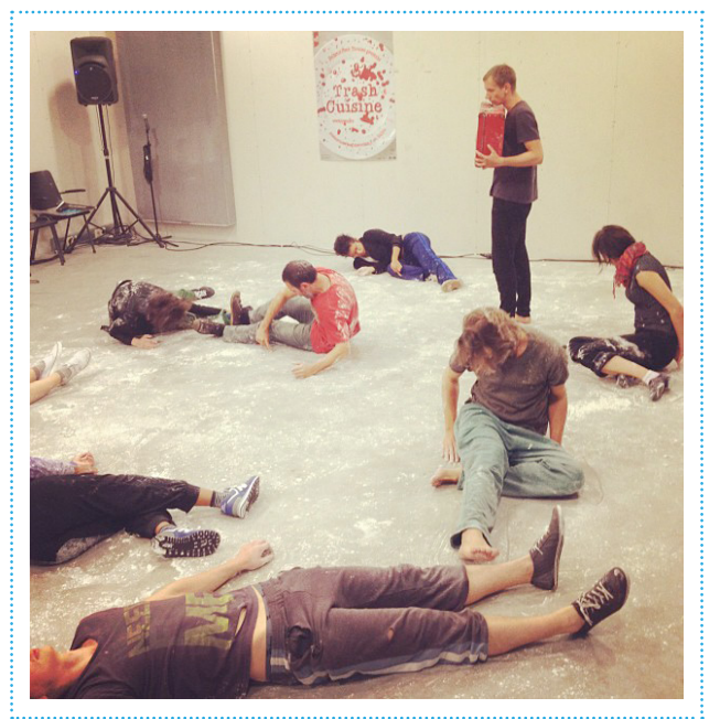
Belarus Free Theatre, 'Trash Cuisine'

The company has gone on to produce a huge number of plays of their own material, many of which deal with subjects considered taboo by the Belarusian government. They have developed a body of work that focuses on personal and societal taboos and campaigns on human rights. However, the whole point of our struggle is that we are outraged by the Belarusian regime because they prohibit the theatre that talks about the world and people in it. As a result of their work, the founders and artistic leaders of the company were forced into exile and they are now political refugees in the UK. The BFT now exists between two spaces, the UK and Belarus. In Belarus the company is illegal and exists in hiding, keeping their performances secret and low-key. They communicate with their audience to arrange shows via text message, with meeting points from which audience members are escorted to the performance venue. This could be a suburban house lent to them for the event, or a disused canteen, or a clearing in a forest, or a garage. This leads to a unique interaction between audience and performer.