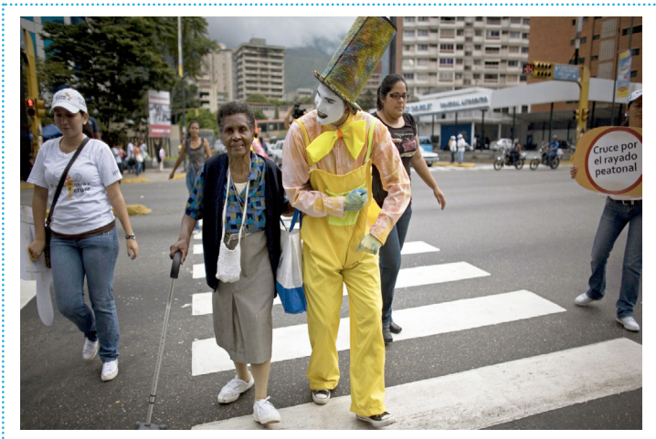
Traffic mimes' in Bogotà, Colombia.

1~ \, P. Wiebel, People. Politics and Power in 'Global Activism', p.59 \,