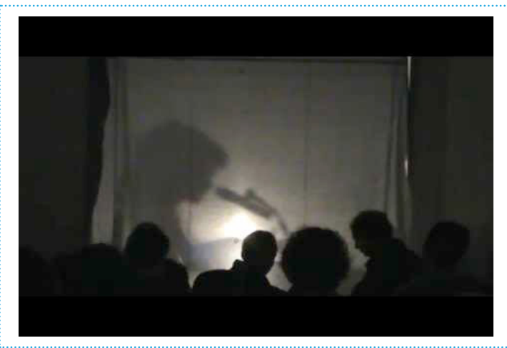
Eugenia Tzirtzilaki, 'Linda - Prima vista'

This work stemmed from a very specific political situation, the rise of the neo-Nazi party Golden Dawn, which can be seen to mirror the growing rise of the far right in many European countries. With austerity hitting hard on people's everyday lives, the extreme right discourse sounded convincing for an increasing number of people and impacted on the public discourse – migrants endured violent attacks on a regular basis. Tzirtzilaki felt that counter-arguments are not enough at this critical moment: