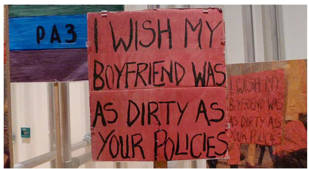
Picture from the exhibition 'Disobedient Objects' at Victoria and Albert Museum, London, 2015