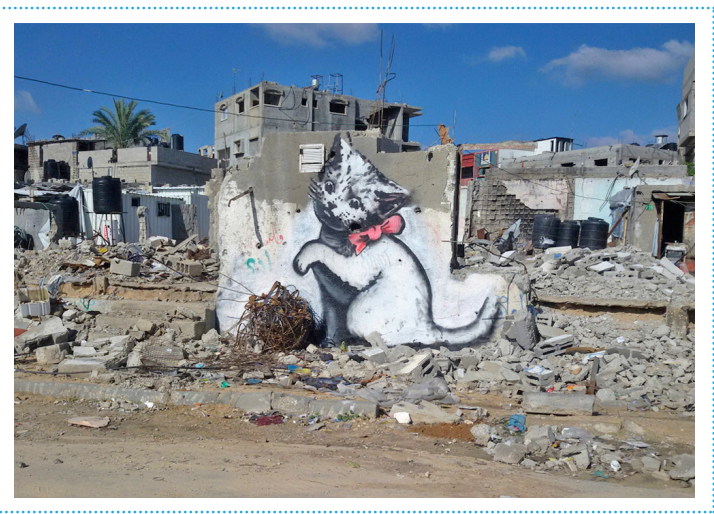
Bansky's graffiti in Gaza (picture from <u>Bansky's website</u>)

Similar to the South African artists' plea in 1976 for a boycott of arts supported by the government, the call for a boycott has not come from outside. The Boycott, Divestment and Sanctions (BDS) campaign was launched on 9 July 2005 by a group of 171 Palestinian NGOs, and focused on economic and political boycotts of Israeli goods and state-sponsored institutions. The guidelines are very clear that this is not a boycott of Israelis, but of the Israeli state. A key part of the BDS movement is the Palestinian Campaign for the Academic and Cultural Boycott of Israel (PACBI). This movement was launched from inside Palestine and adheres to the aims of BDS. with a specific focus on academic and cultural workers, with groups outside the region adding their voices. It is important to view this boycott as a tactic, rooted in its wider context, as John Berger said when signing up in 2006<sup>2</sup>. As Nelson Mandela has pointed out, boycott is not a principle, it is a tactic depending upon circumstances. A tactic which allows people, as distinct from their elected but often craven governments, to apply