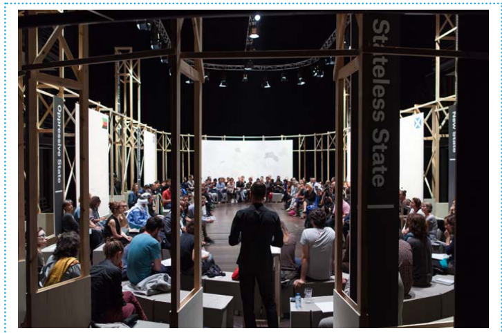
Jonas Staal, 'The New World Summit' - 2014 edition in Brussels

The New World Summit was established to challenge this shift to the 'generic'. As politics is unable to act upon the promise of what Staal calls 'fundamental democracy', the New World Summit explores at what level art can operate as an instrument to create an 'alternative political space'. The New World Summit opposes the democratist notion that there is such a thing as a 'limit' to democracy, for democracy is either limitless or it does not exist at all. The existing political order is unable to act upon this principle, as its interests are largely defined by geopolitical economic and political interests. The New World Summit thus claims art as a radical imaginative space 'more political than politics itself, as a space where the promise of an emancipatory, fundamental democracy can take shape. The New World Summit pushes this question of 'what is art', with an enactment of the possible as its creative work.