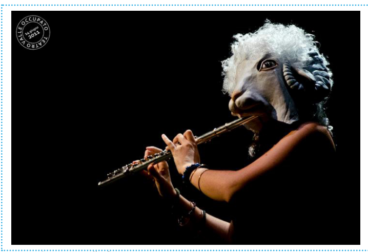
An event in <u>Teatro Valle Occupato</u>

Over the course of these three years, the project became a living experiment of performance art, citizenship and community engagement. According to Della Ratta a significant amount of the time in the theatre was dedicated to citizenship building, with seminars and workshops focusing on topics such as 'what does it mean to be a citizen', training