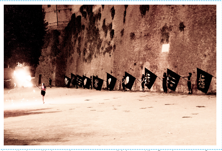
Motus/Andreco, 'L'erba cattiva non muore mai'