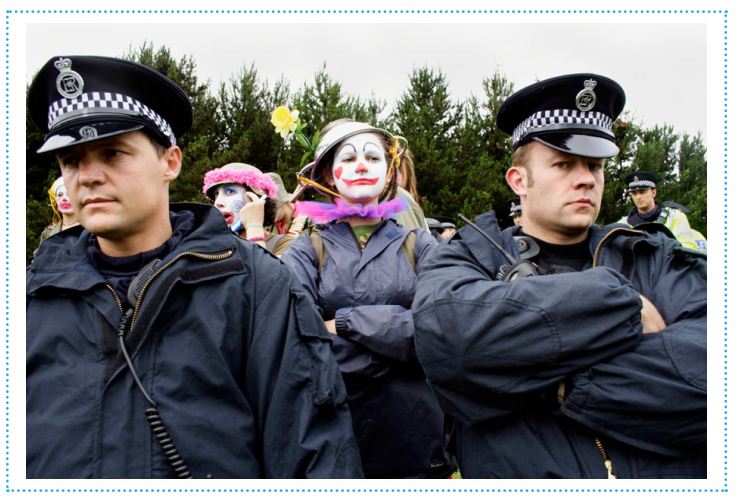
Laboratory of insurrectionary immagination, clown police during the G8 in in Scotland 2005

However, labels can be useful in order to get your audience on board, as Jordan details: If I'm talking to a bunch of activists in a squat I might call what we do art activism, or activism. Or if I'm talking to the Prague Quadriennale I'll talk about it as a radical form of scenography. Or if I'm speaking to water engineers I'll discuss it as environmental work. So it's just about framing. Use the language that people are used to.