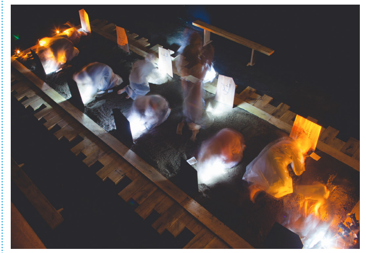
Tania El Khoury, 'Gardens speak' (picture from Tania El Khoury's website)

There are times when your work is so compromised by the political environment that you should not be doing it. It can be very difficult to know this in advance, but it's important to recognise that the arts are used strategically to give an impression of the humaneness of certain contexts or of certain political actors, and we have to be very aware how we may be used.