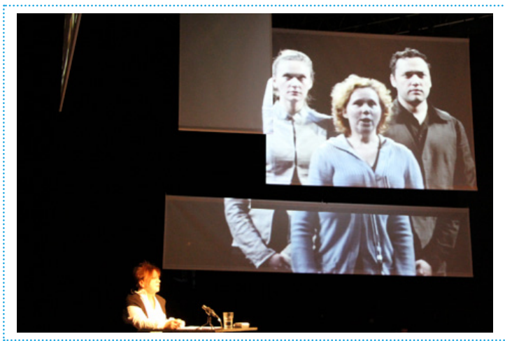
PanoDrama, 'Word for word'

This focus, on looking at the larger, collective responsibility for the creation of an atmosphere in which attacks can take part, rings relevant throughout citizenship practices, and can certainly find parallels in the dangerous rhetoric around refugees and migrants emerging across Europe in 2015.